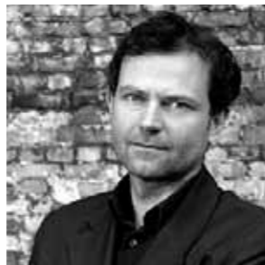
design A.W. Faust